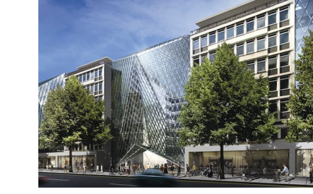
Knight Frank Finance inks tie-up with major insurance