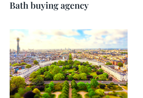
London remains Europe's most expensive city to buy property