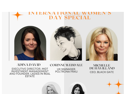
Women's Day sparks 'possibly the most honest conversation in property to date'